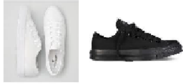
Solid Black or White Sneakers