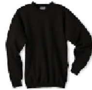
Pullover Sweatshirt (Navy Blue, Black)