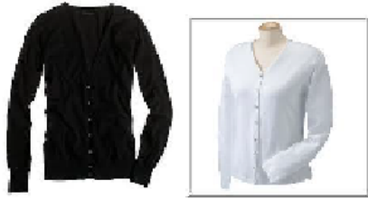
Cardigan Sweaters Black, Navy Blue, white