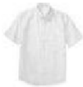
Oxford White Shirt