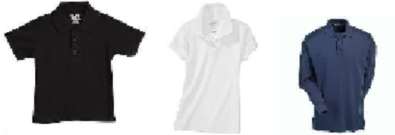
Long or short sleeves Polo Style Shirts (Navy Blue, White, Black)