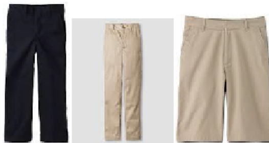
Khaki (tan), Black, Navy Blue or Black Uniform Pants or shorts